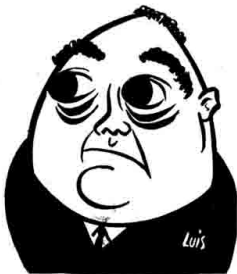
J. Edgar Hoover

The top political cop, J. Edgar Hoover, got into the act indirectly with an article in the June issue of the FBI law enforcement bulletin. He red-baited last spring's March on Washington by students protesting against the war in Vietnam, claiming that "Communists" were there from "all over the country." Crudely striving to incite a witch hunt against the student movement, he added that "Communists" are still busy "striving to start demonstrations." The government's smear cam-