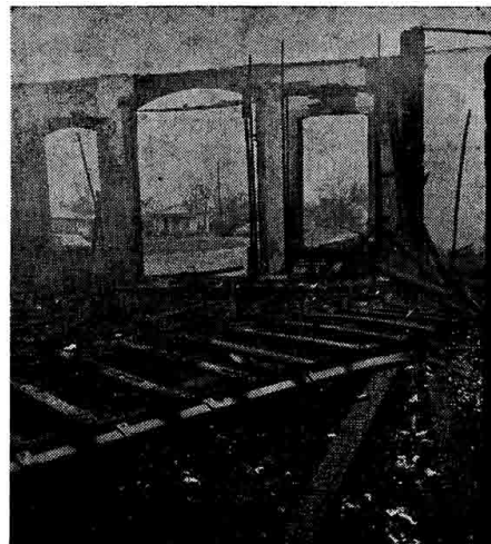
WHY DEACONS ARE NEEDED. This scene of remainder of SNCC Freedom School in Indianola, Miss., after it was fire-bombed by racists is a grim reminder of the need for organized self-defense by black communities.